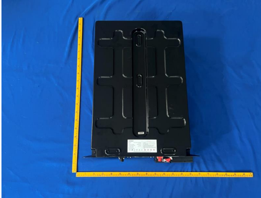
样品图片 (Sample photograph) -2