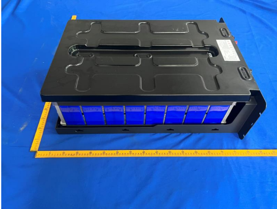
样品图片 (Sample photograph) -4