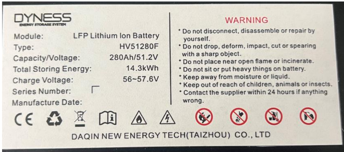
样品图片 (Sample photograph) -8