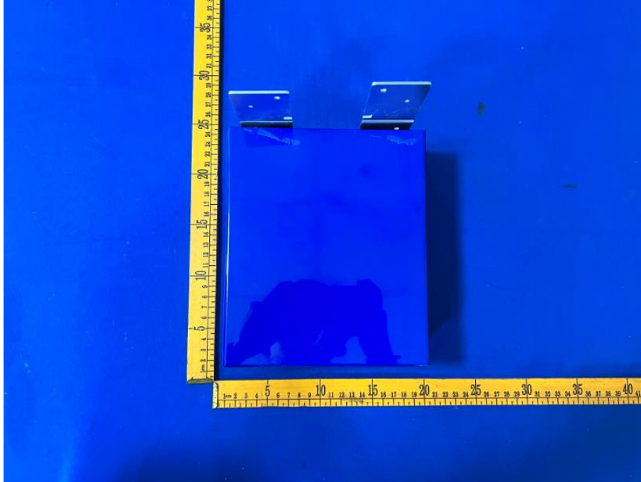
样品图片 (Sample photograph) -9