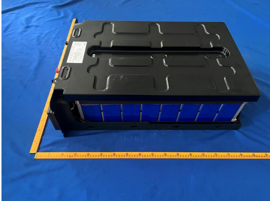
样品图片 (Sample photograph) -6