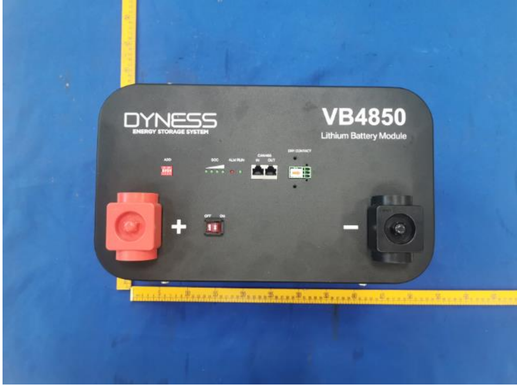
样品图片 (Sample photograph) -2