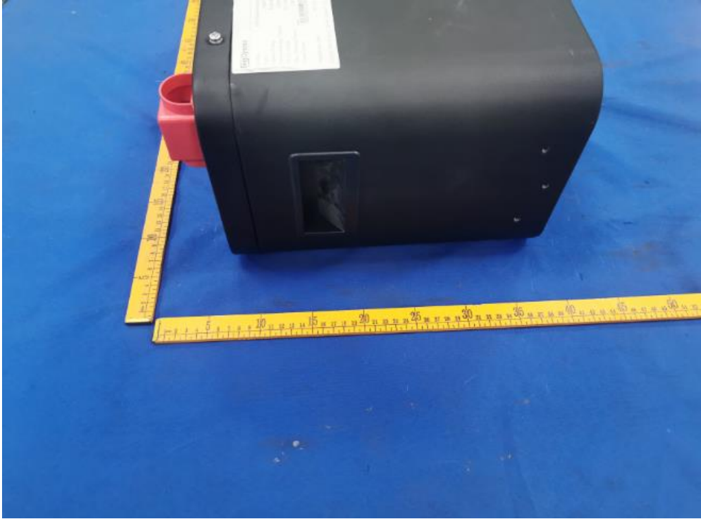
样品图片 (Sample photograph) -4