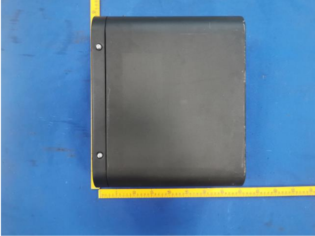
样品图片 (Sample photograph) -6