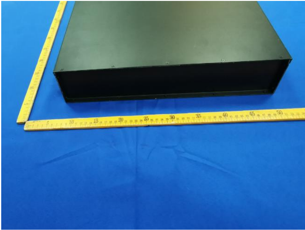
样品图片 (Sample photograph) -6