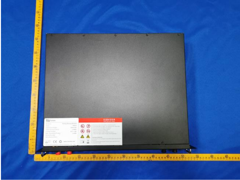
样品图片 (Sample photograph) -2