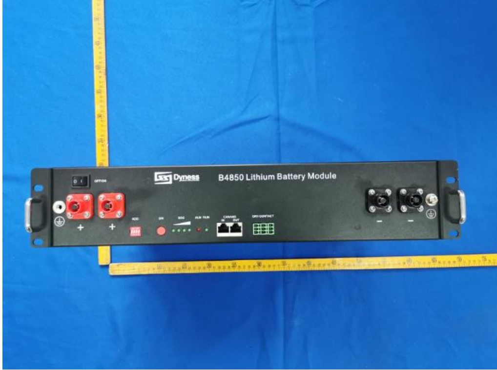
样品图片 (Sample photograph) -4