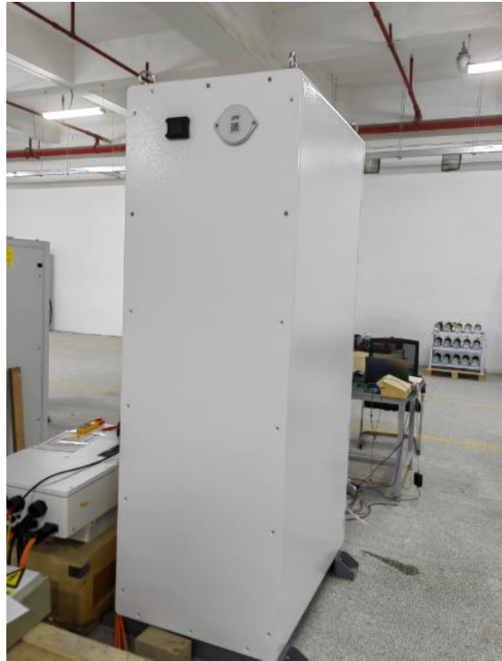
样品图片, 电池柜(Sample photograph, Battery cabinet) -4