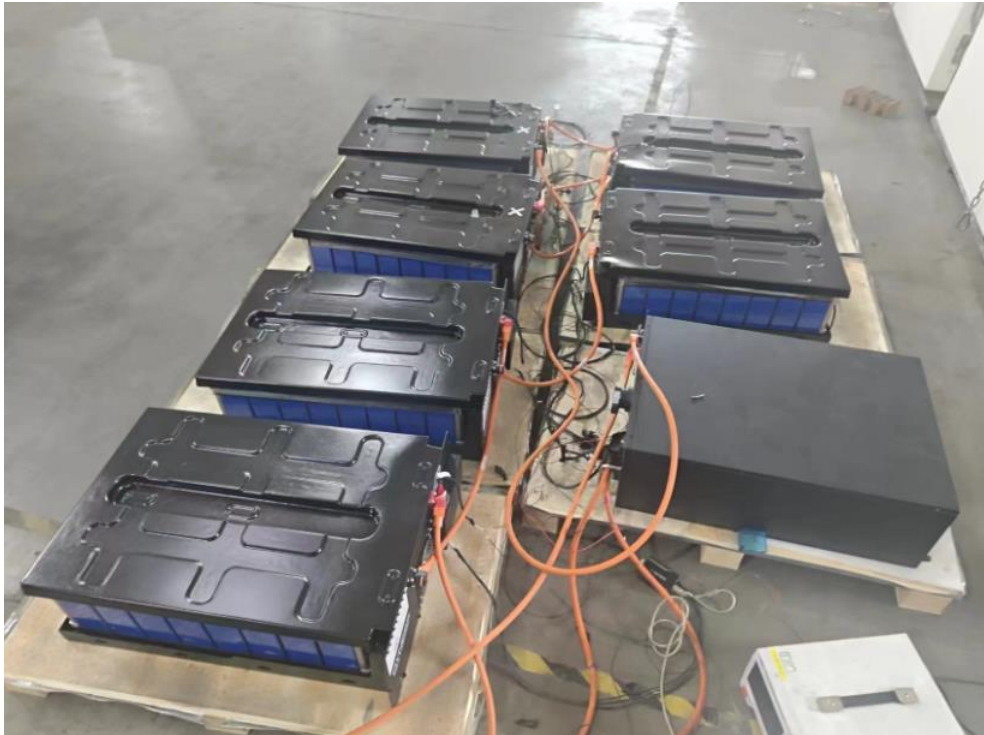
送测BDU样品图片 (Send BDU sample images for testing)-8