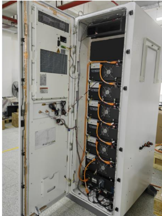
铭牌, 电池柜 (label, Battery cabinet) -6