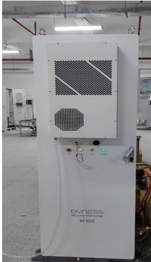
样品图片, 电池柜(Sample photograph, Battery cabinet) -2