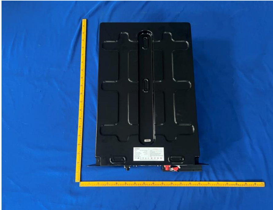
样品图片,内部电池模块 (Sample photograph, internal battery module)-10